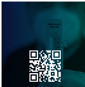
Theés okkol Odhar goro